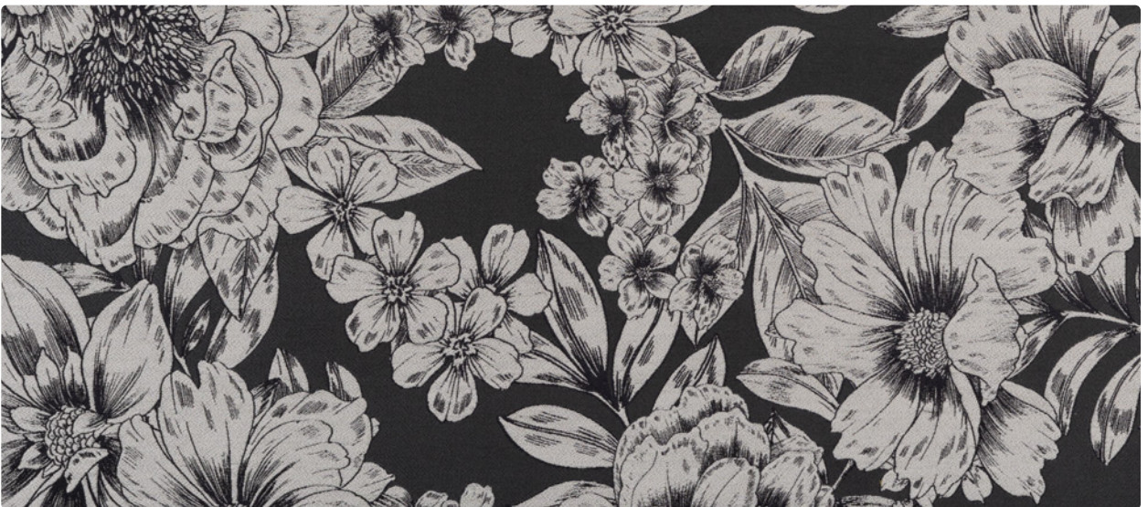
800-006 White Oleander

Shown at approximately 25% scale. Due to color variations in printing, actual swatch colors may vary slightly. Please order a memo sample prior to placing any order.