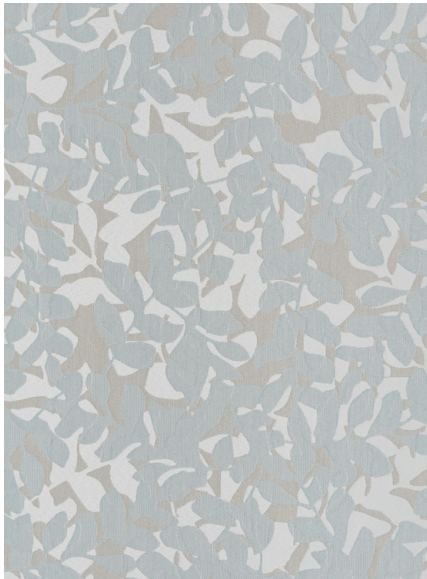
PC20-017 River Rock